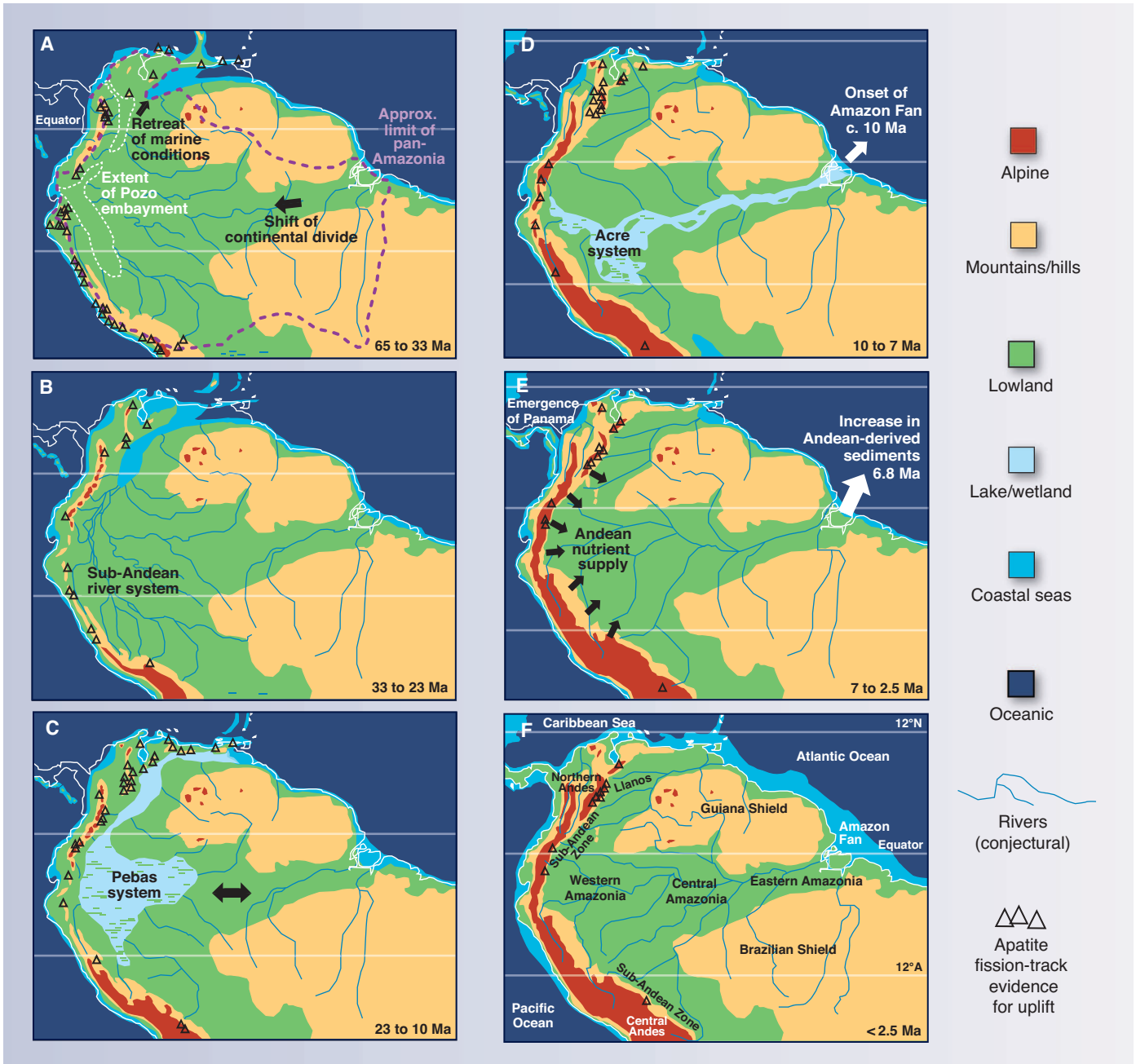
Fig. 1. Paleogeographic maps of the transition from “cratonic” (A and B) to “Andean”-dominated landscapes (C to F). (A) Amazonia once extended over most of northern South America. Breakup of the Pacific plates changed the geography and the Andes started uplifting. (B) The Andes continued to rise with the main drainage toward the northwest. (C) Mountain building in the Central and Northern

tectonic readjustments [(23); see also references in (16)]. Plate subduction along the Pacific margin caused uplift in the Central Andes during the Paleogene [65 to 34 Ma; see references in (14, 16)]. Posterior plate breakup in the Pacific (~23 Ma) and subsequent collision of the new plates with the South American and Caribbean plates resulted in intensified mountain building in the Northern Andes (figs. S1 to S4) (16). Mountain building first peaked in this region by the late Oligocene to early Miocene (~23 Ma), at an age